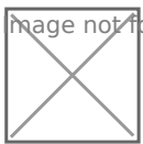
Figure 13 2 CWIS Indicators Monitoring and Evaluation