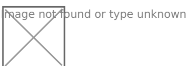
Figure 18- 1 Export to Shape File or KML file page