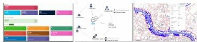
Figure 3: IMIS Facilitating in CWIS Implementation